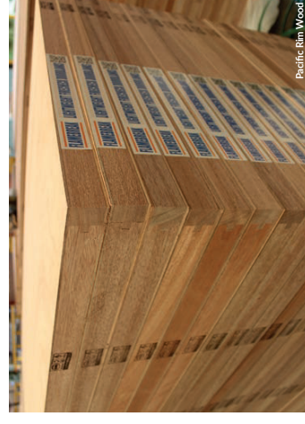
Pacific Rim Wood