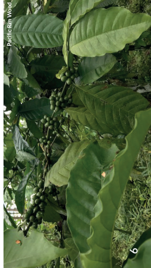
Pacific Rim Wood