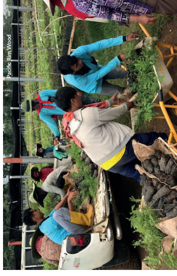
Pacific Rim Wood

"Falcata also has other benefits at local producer level. It is grown as a canopy tree, enabling the small farmers supplying the mills to gain a second crop from the land underneath. Common crops grown beneath Falcata trees include ginger, coffee and cocoa. It therefore returns multiple benefits to local communities," Pacific Rim's Shaun Hannan reveals.