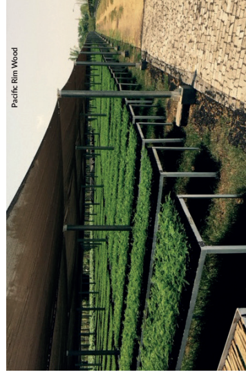
Pacific Rim Wood