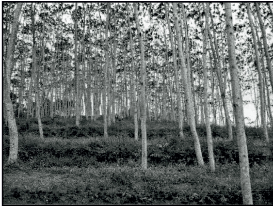
P.T. Kutai Falcatta plantation

Notwithstanding any other considerations, Pacific Rim Wood Ltd. and P.T. Kutai Timber Indonesia have a vested interest in ensuring the sustainability of the raw materials used for the manufacture of FLAMEBREAK™ door cores and are strong supporters of the FSC ( Forest Stewardship Council ).